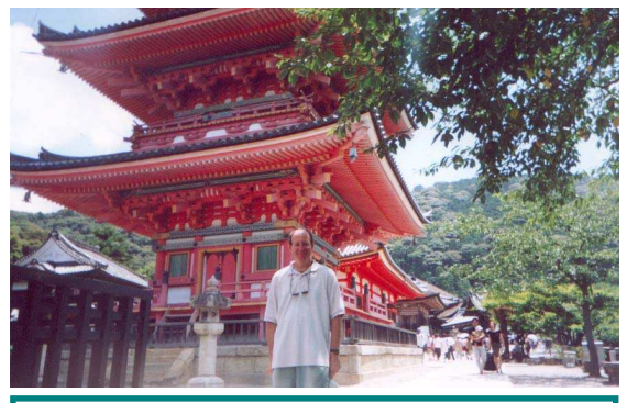
Above I'm standing in front of an interesting and sprawling temple in the hills overlooking Kyoto. To the left is a garden at the Shogun Palace.