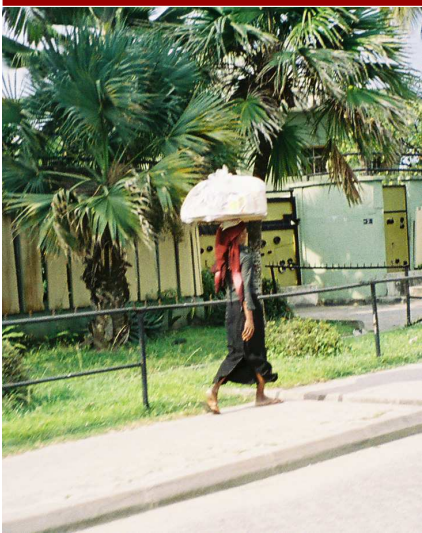
Above, the time honored method of getting goods to market, or home. A look at part of Lagos, from a distance, then a car dealer, up close, complete with vegetable stand in front, in the parking lot.